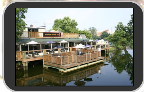
On the Waterfront in Downtown Salisbury