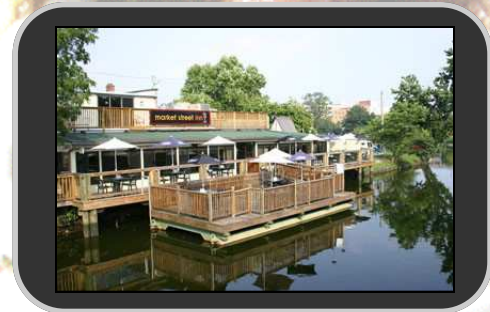
On the Waterfront in Downtown Salisbury